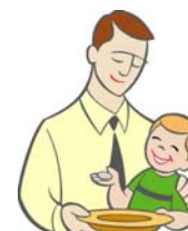
God Loves a Cheerful Giver

Thank you for your generous contributions to this year's Faith Promise. As of November 9 th we had received 104 pledges totaling over $132,000, compared to 99 pledges totaling $144,000 last year.